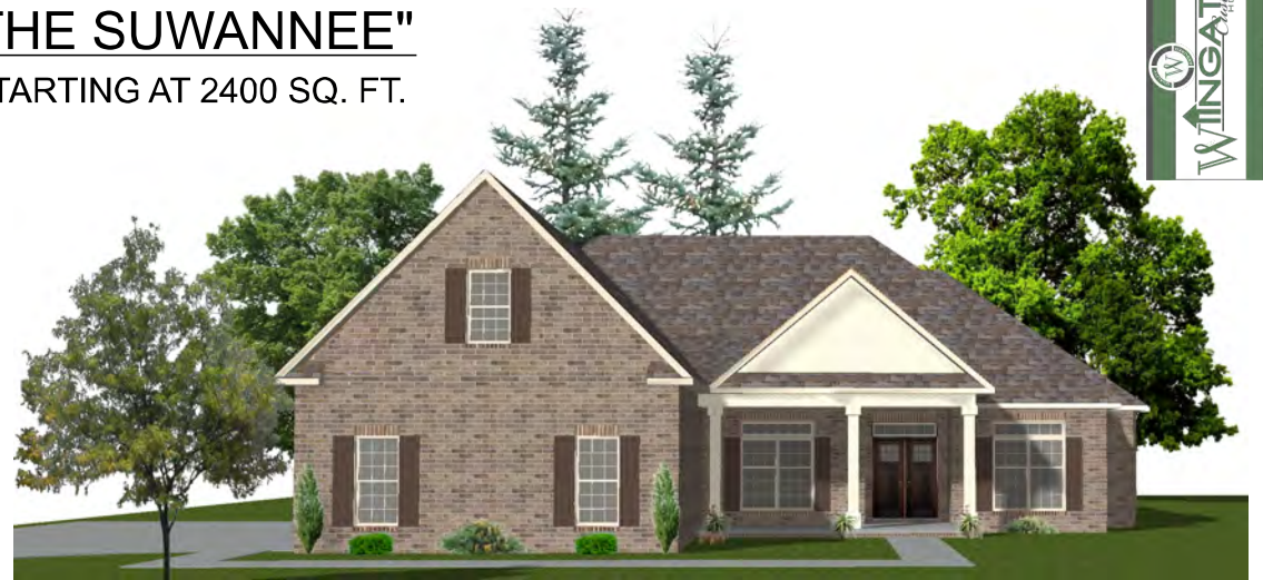
ELEVATION OPTION 1