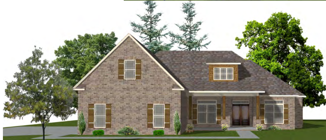
ELEVATION OPTION 3